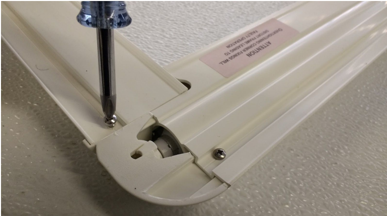
Do the same thing to the other side and separate end cassette