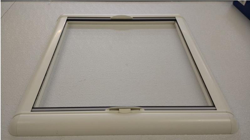
Turn blind over and unscrew siderail from end cassette